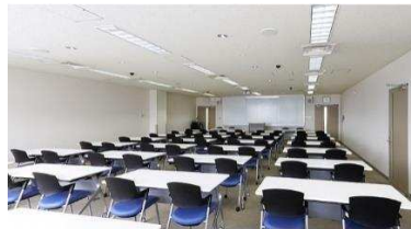
Breakout room 3