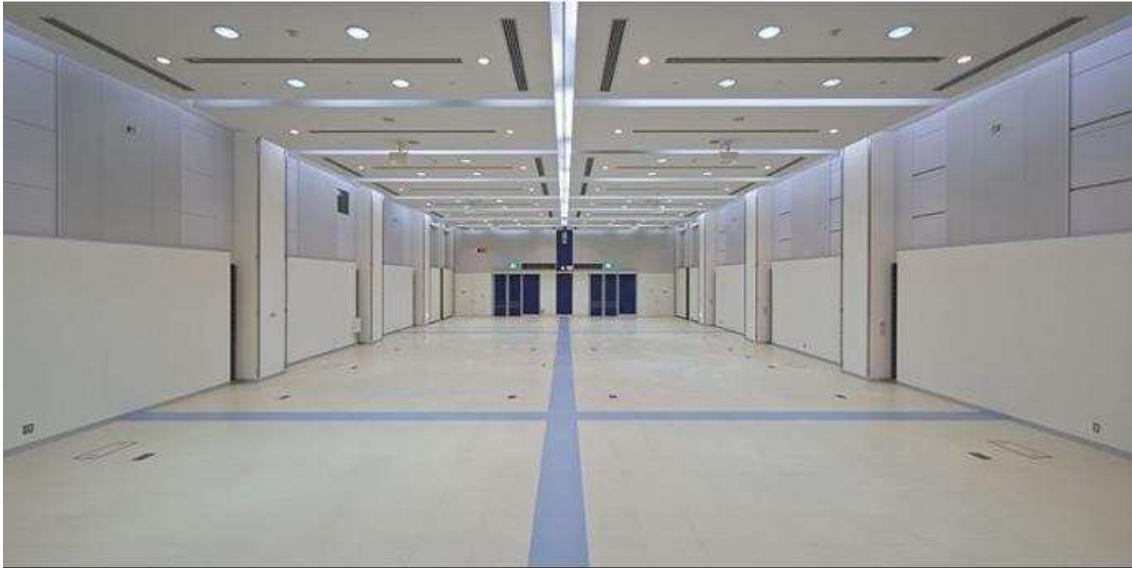
Plenary room /Breakout 1: for more than 300 attendees in theatre style