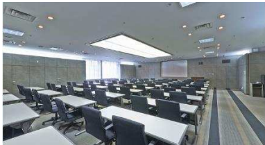
Breakout room 2