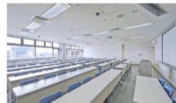
Breakout room 4