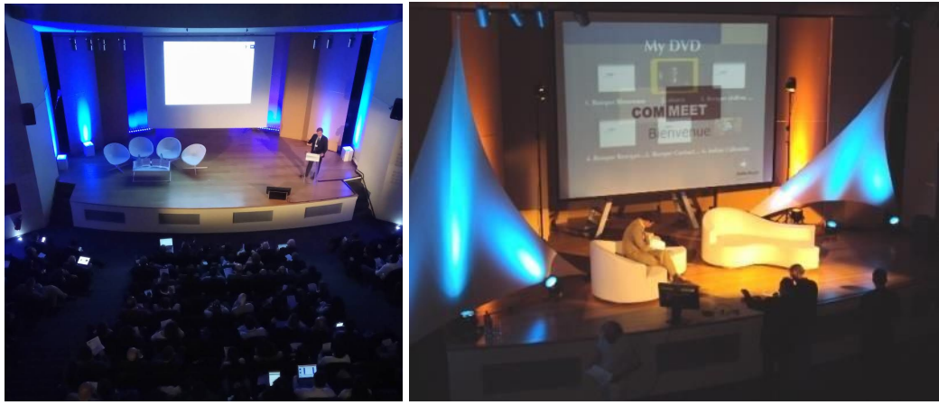
Auditorium Henri Michaux 100 persons